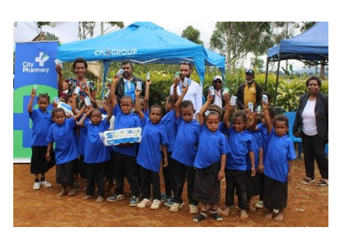
School Students happily showing off their hygiene gifts from CPL

More than 20,000 people in the Tengtenga community, located outside Mt. Hagen City, benefited from access to clean and safe drinking water, thanks to the Western Highlands Provincial Health Authority (WHPHA). This initiative coincided with World Water Day and is expected to have a lasting impact on the health and well-being of the community, particularly the younger generation, helping them grow up strong and healthy.