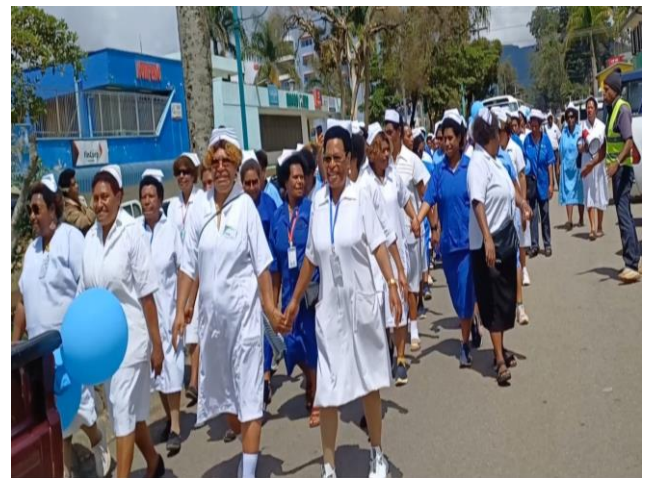
Nurses in Western Highlands Province commemorate Nurses Day