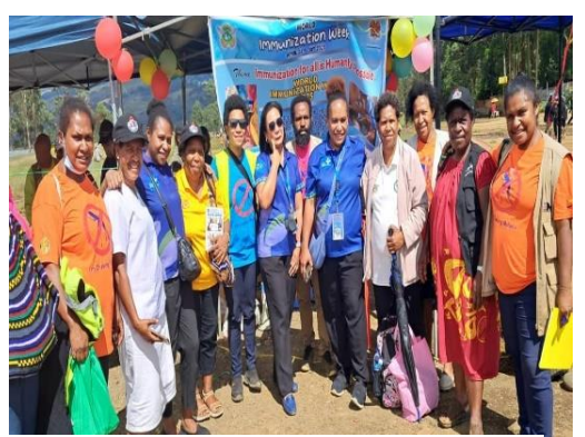
WHPHA's Public Health Team and City Pharmacy Ltd Team Pose for a group photo after celebrating World Malaria Day and World Immunization Week in Mt Hagen recently.