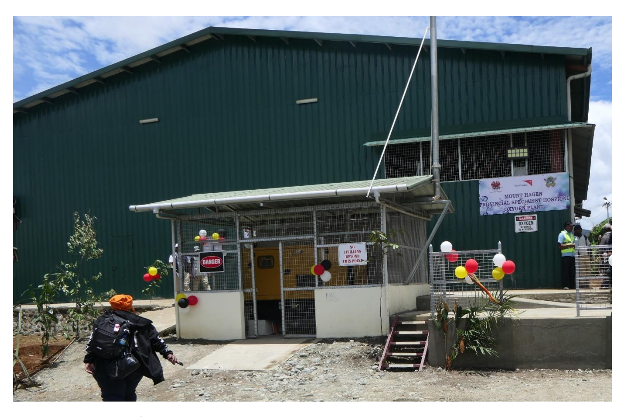
3. PSA Oxygen plant facility