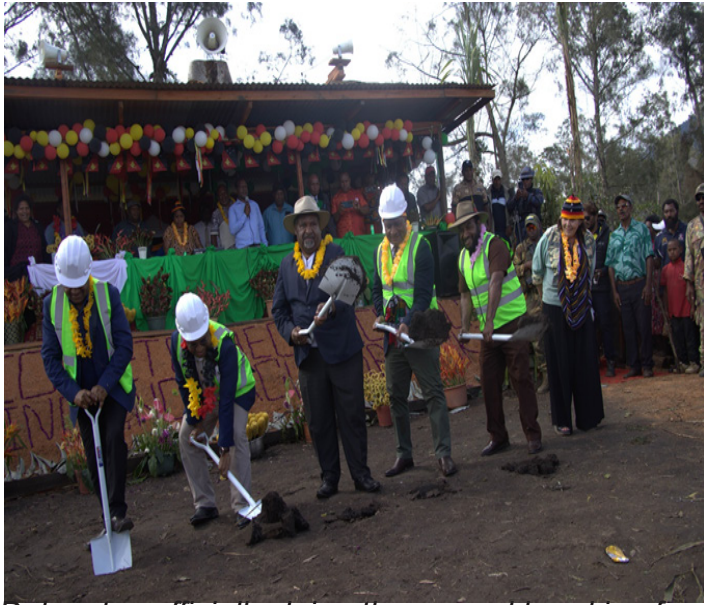
Delegates officially doing the ground breaking for Kinjibi Community Health Post.