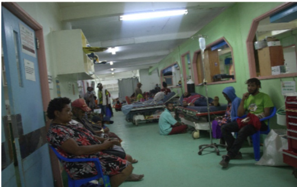
Picture Caption: Patients at the Mt Hagen General Hospital's Emergency Department.

Also, the Hospital has recorded 9 babies delivered on the 25th of December 2023, and 10 babies born on the 01 January 2024.