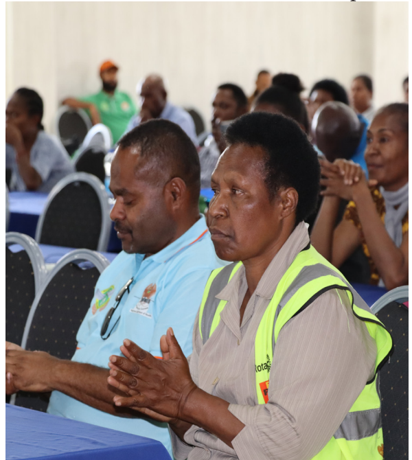
Our staff who attended the NHI workshop

Western Highlands Provincial Health Authority hosted the annual National Health Information (NHI) Workshop in Mt Hagen on the 06- 10th of November 2023 with the theme “Advancing health in PNG: leveraging digital health and health information”.