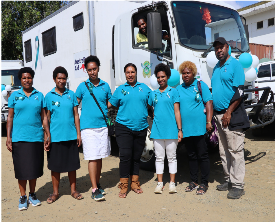
Cervical Cancer Program staff gearing up for a road show awareness.