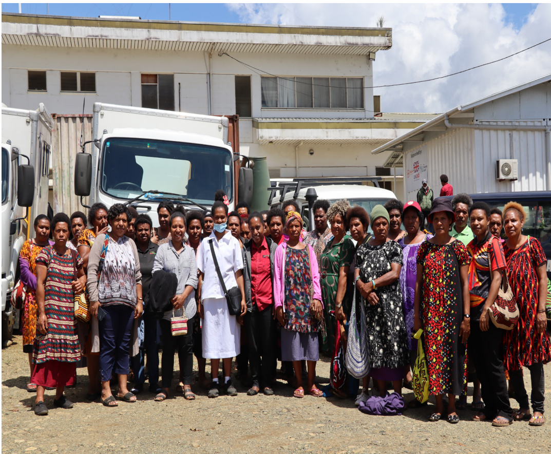
Tininga Limited is a locally owned company that sends in staff in numbers daily for cervical can-cer screening and testing. Pictured is a group of staff from Tininga who came for screening at the clinic.