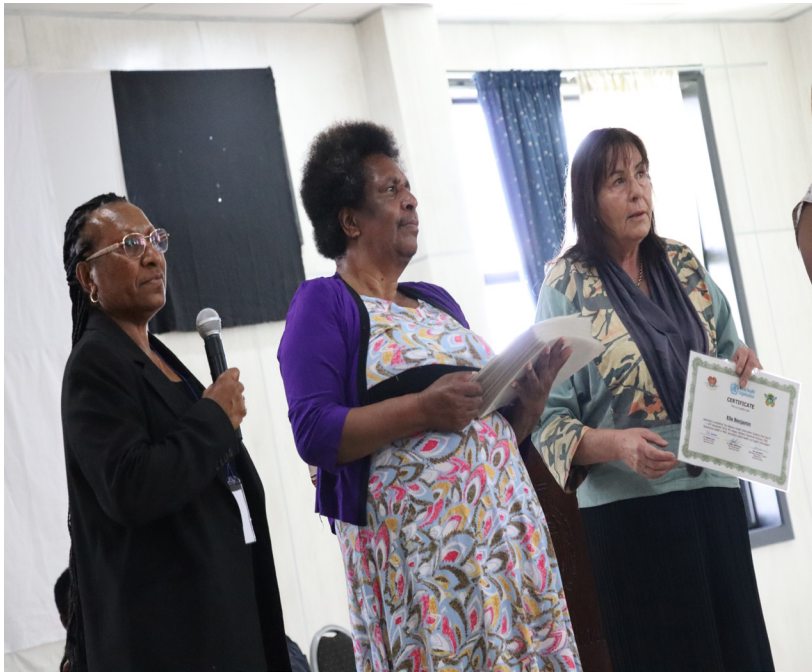
Presenting of Certificates to participants of the week long NHI workshop by WHPHA