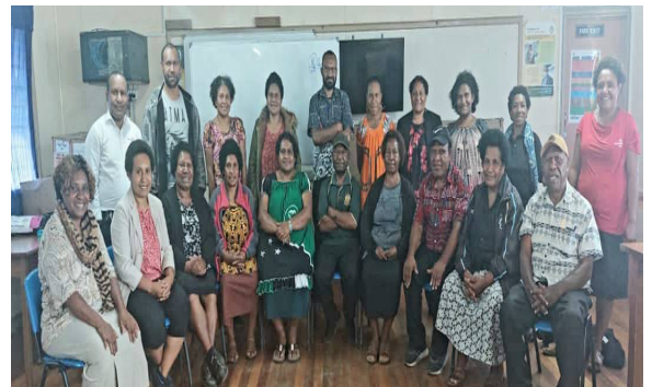
Photo Caption : PHA Staff with Nambawan Super training officer after the Financial Literacy training