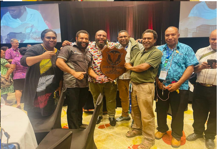
Photos of our PHA medical staff and Board Chairman during the 57th Annual Medical Symposium in Port Moresby