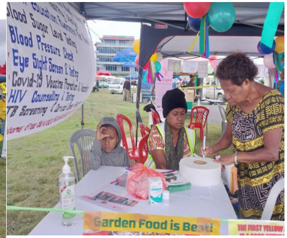
Our staff and booths set up during the Mt Hagen Cultural Show