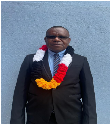
2: Sent Kolda- Deputy Chairman