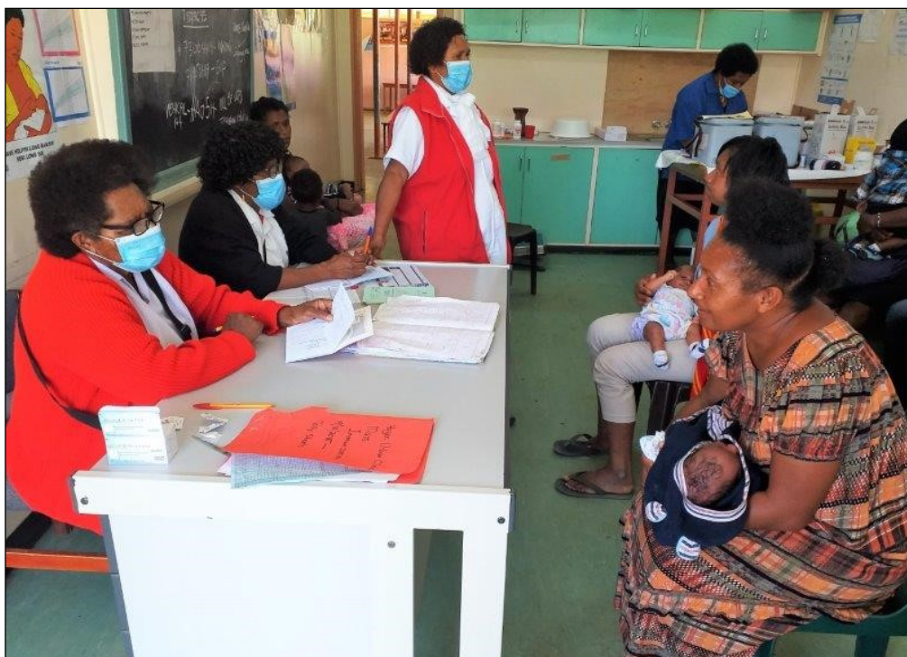
Nurses at the Mt Hagen Urban Clinic counselling mothers on family planning before vaccinating their babies.