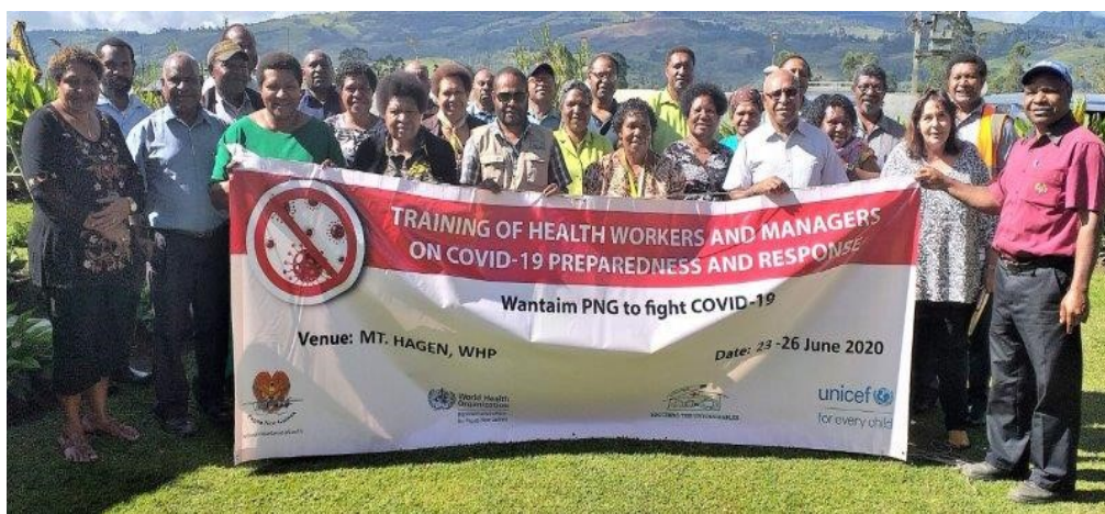
The participants pose for a picture with the theme of the workshop displayed in front of them.

Mr Neng said this action was made possible through the kind assistance of donor agencies and