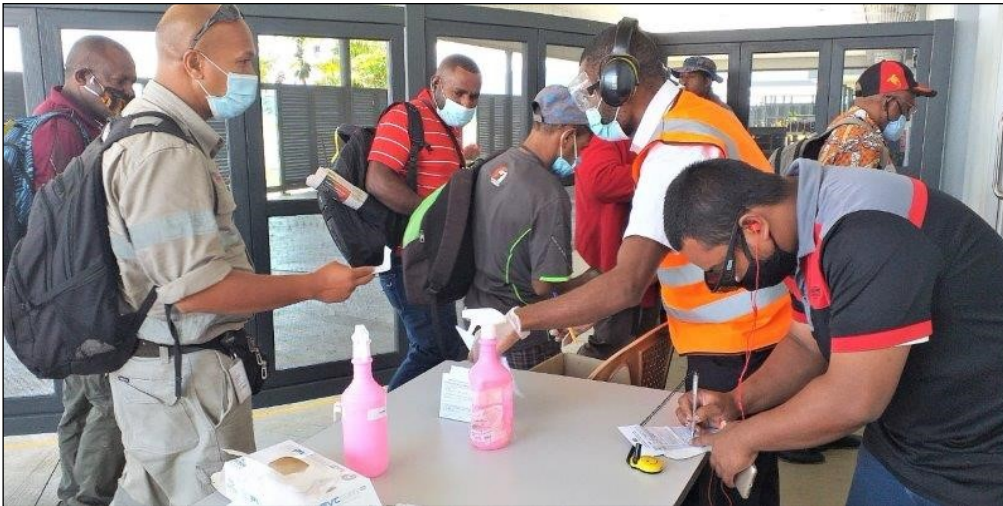
Passengers arriving on a Port Moresby flight going through the Covid-19 protocols at Kagamuga Airport.

Western Highlands Covid-19 frontline health workers have expressed grave concern that the virus may spread fast in the province due to the arrogant and stubborn attitudes of the travelling public.