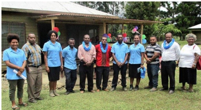
The five students (in blue shirts) with church and WHPHA officials in front of the out-patients building.

Prior to the construction of the veranda, patients have been seeking shelter under nearby pine trees to avoid getting wet from rain and heat from the sun.