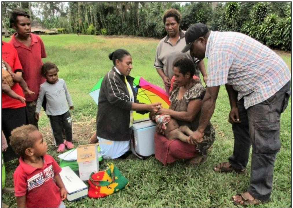
A WHPHA employee helps a mother to comfort her child as a nurse prepares to vaccinate the child.

A service message or toksave had been put on the local NBC radio station in the week leading to 4th March and printed messages had also been placed at strategic locations in all the four districts where the public could easily access them.