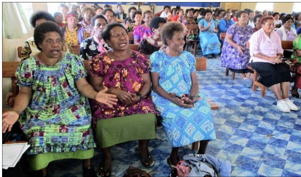
The nurses agreeing to some points raised during their meeting to reconcile with the management.

Nursing staff of the Western Highlands Provincial Health Authority have reconciled with the Management and Board to leave behind their past differences and to work together as a team for the sake of patient care in 2019 and onwards.