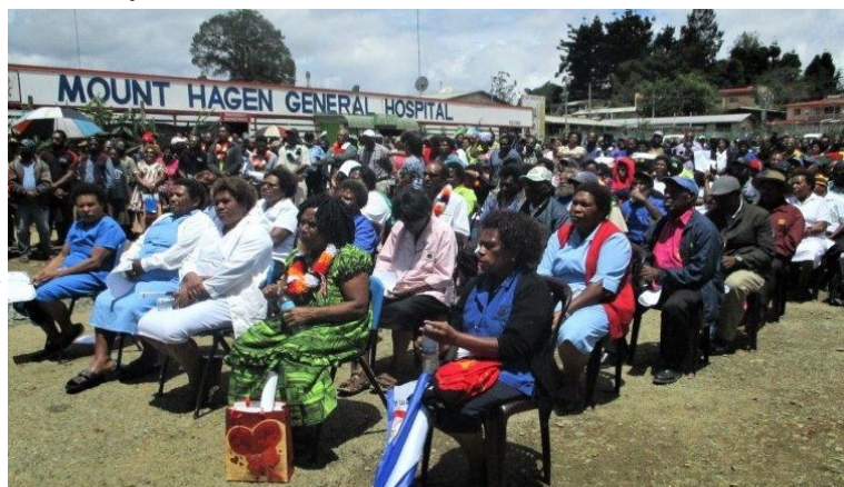
Staff of the WHPHA braved a hot sunny day to witness the launch service in PNG”.