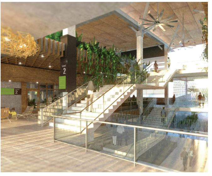
design done and room Pictured above - an artist's impression of the entrance to the data sheets completed. polyclinic and below, work on the pouring of the concrete slab for the nurses accommodation units taking shape.

When completed the 12 accommodate nurses who do night shifts so