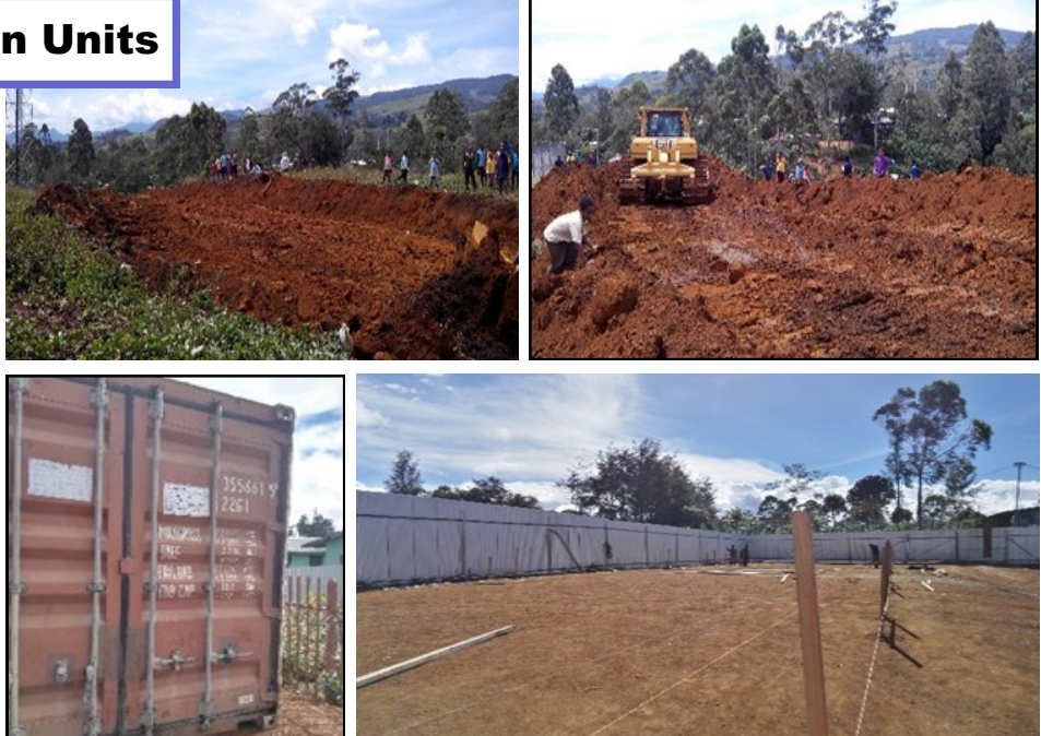
Pictured top - earthworks being carried out while above right, profiling commences and left, one of the many containers with building materials on site.

Since then it has completed the earthworks, repaired the fence and main gate which had been vandalised and has started profiling for actual construction work to commence.